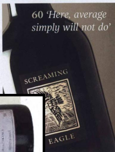
60 'Here, average simply will not do'